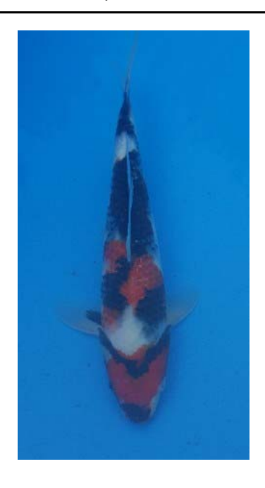
Best Size 2 Owned by Lee Aronfeld