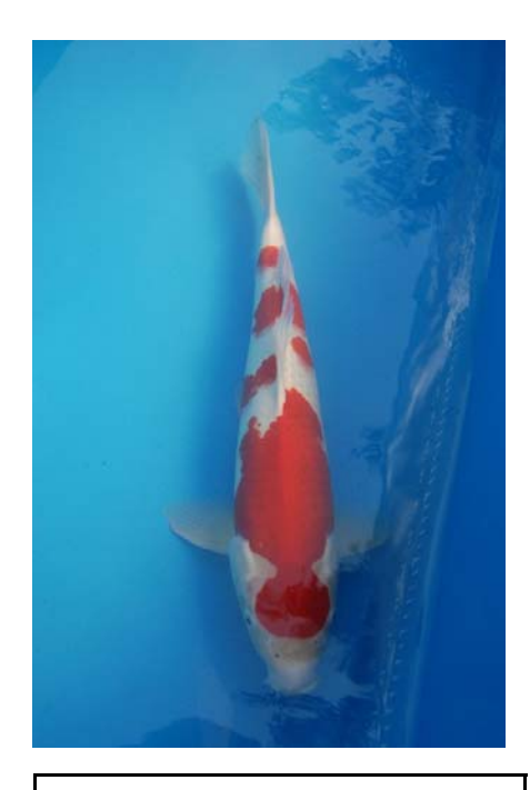
Best Size 4 Owned by Chuck Wilson