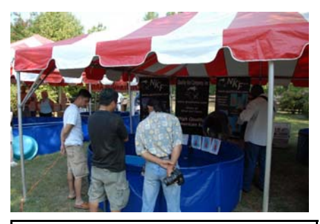
Checking out the vendors