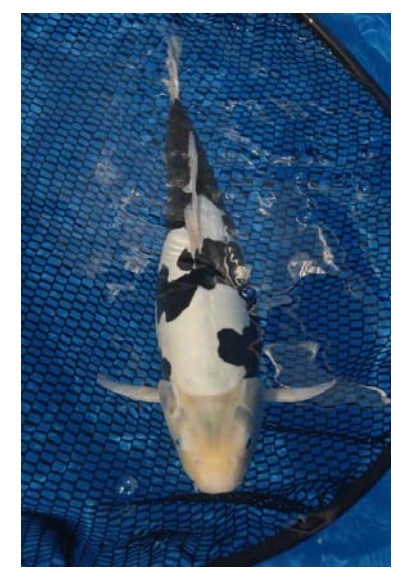
2007 Presidents Award winning kumonryu