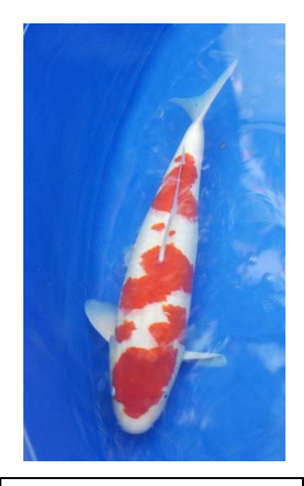
Best Size 5 Owned by Lee Aronfeld