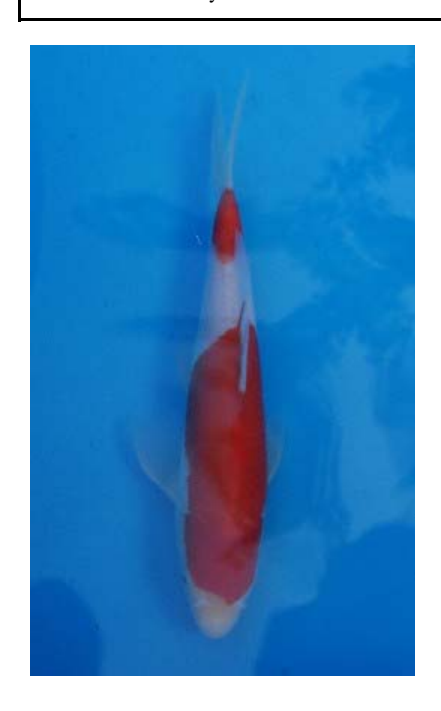
Best Size 1 Owned by Chuck Wilson