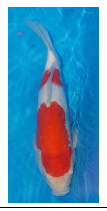
Best Size 3 Owned by Glen Crispell