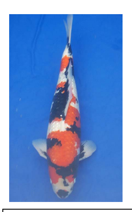
Best Size 6 Owned by Lee Aronfeld