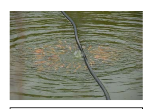
Koi feeding in one of the mud ponds