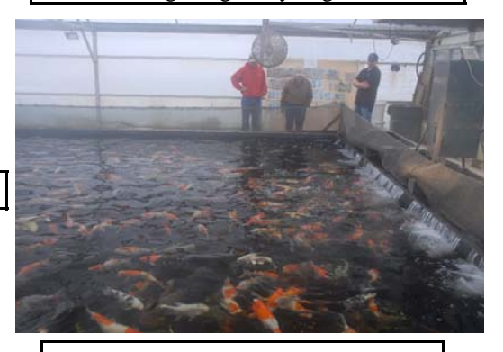
Just a few of the two year olds for sale

Kidai showa getting ready to go in the mud