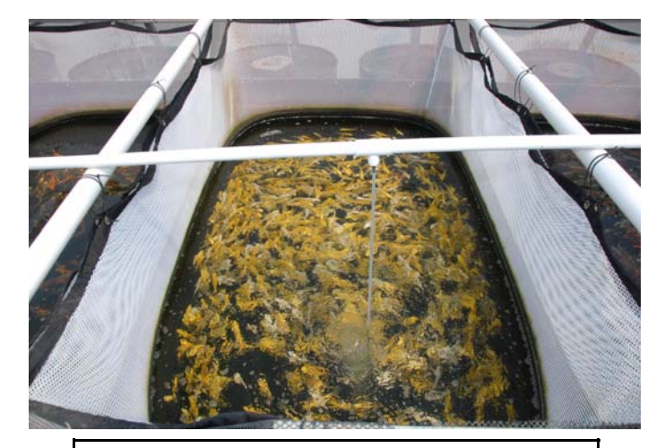
Try and pick the best yamabuki from this crowd!