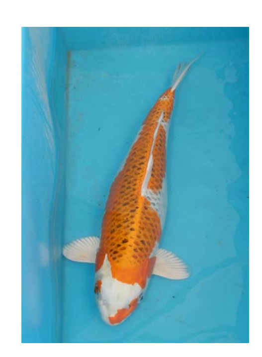
Kujaku from Quality koi