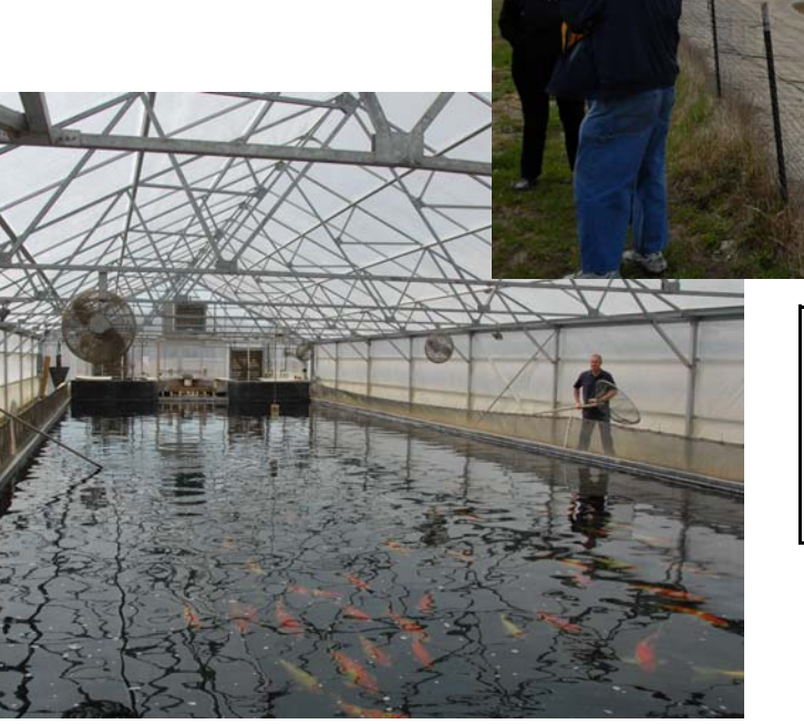
ing life on the farm to the left while on the right is an empty fry pond. By now this pond is full of water and awaiting the massive amounts of fry.