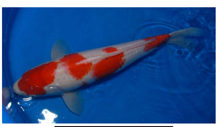
17" Shintaro kohaku for auction