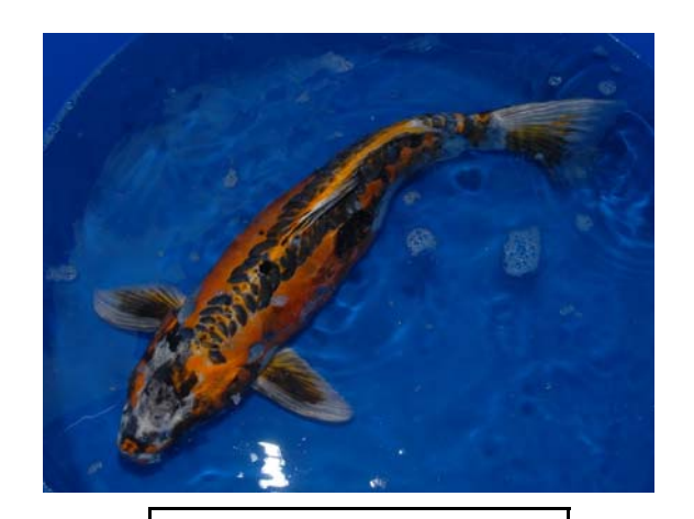
17" Kikokuryu for auction