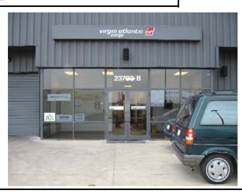
Delta Dash building at Dulles (notice its at Virgin Atlantic)