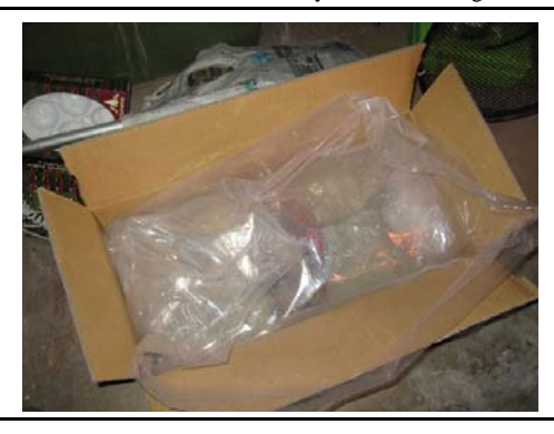
Open the box carefully to avoid bag damage.