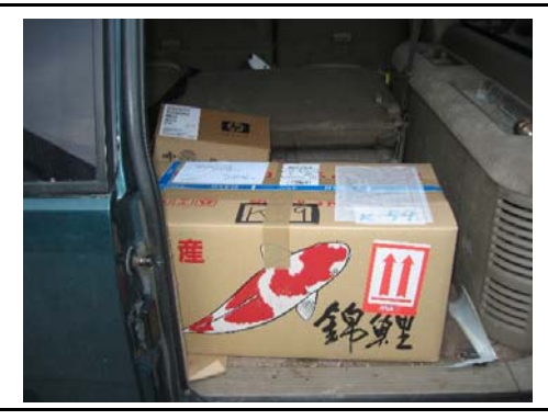
The box should be sideways when traveling.