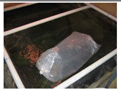
Always float the bag in your Q-Tank.