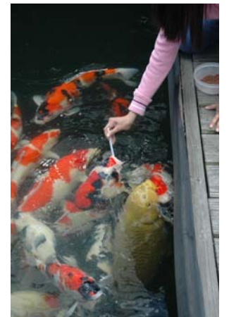
Hand feeding with a spoon!!