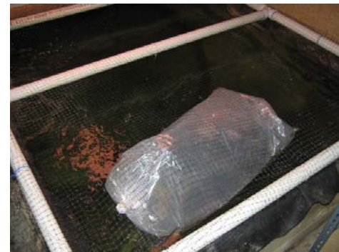
Always float the bag in your Q-Tank.