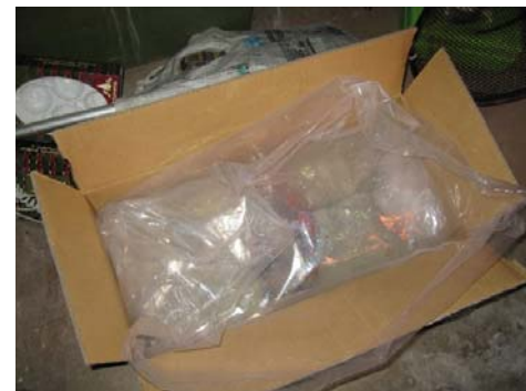
Open the box carefully to avoid bag damage.