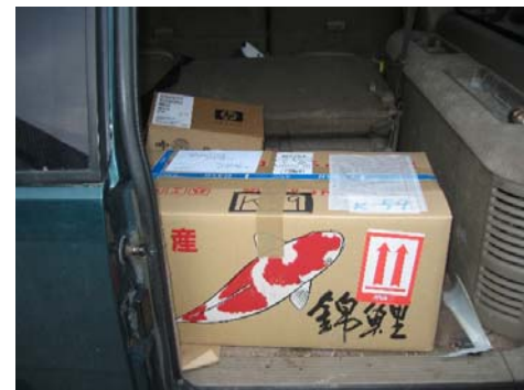
The box should be sideways when traveling.