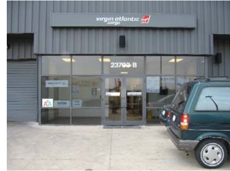
Delta Dash building at Dulles (notice its at Virgin Atlantic)