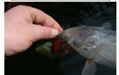
Koi can easily be trained to hand feed.

NEXT Meeting is August 26, 2007 2pm at the Poppe's house! See page 7 for directions.