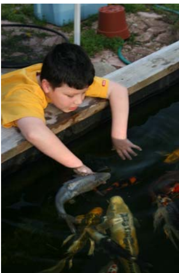
Feed 'em by hand.