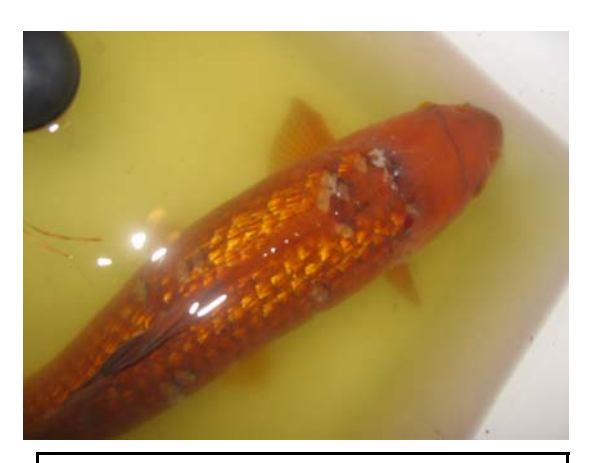
Examine your koi for signs of ulcers etc