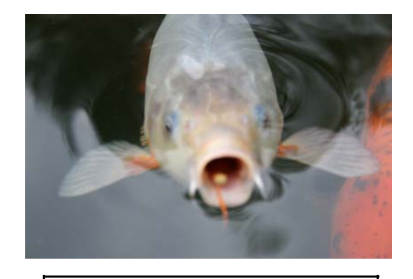
Yes they are hungry but remember to feed sparely until the temps stabilize